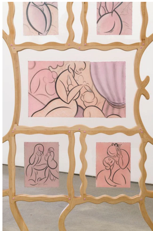
Right: Modesty, 2018 (detail)