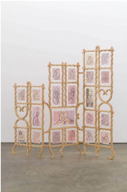
Left: Modesty, 2018