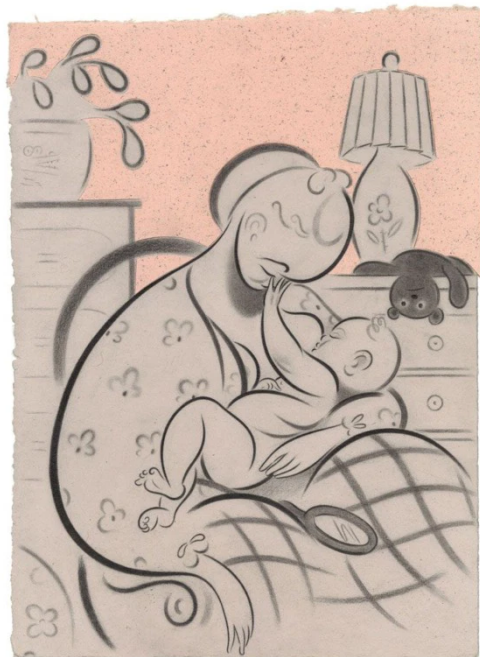
Axis, 2020