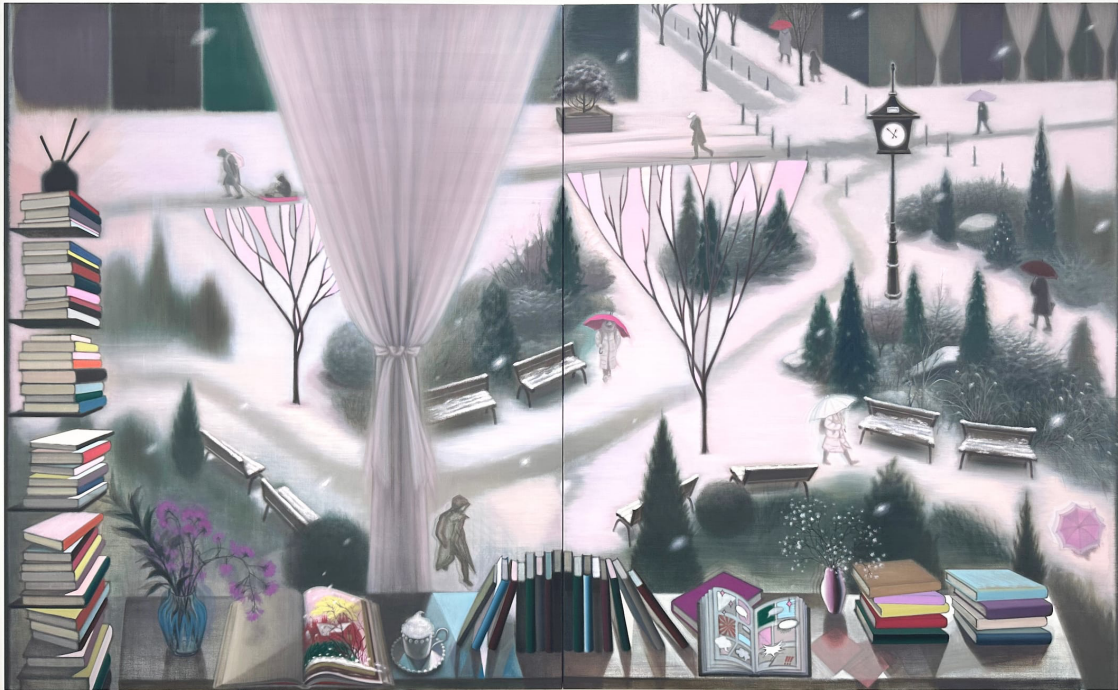
Guimi You, "Still Books" (2023), oil on linen, 79 7/8 x 65 inches

Your paintings exude a sense of sweet, childlike wonder, where each moment is filled with possibility.