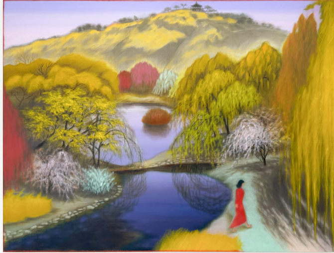
Guimi You, "Spring in the Forest" (2023), oil on linen, 76 x 57 1/8 inches