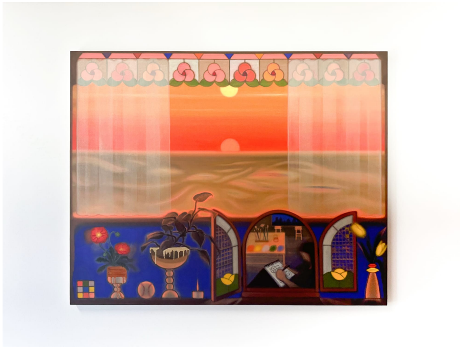
Guimi You, "Orange Studio" (2023), oil on linen, 63 7/8 x 51 1/4 inches