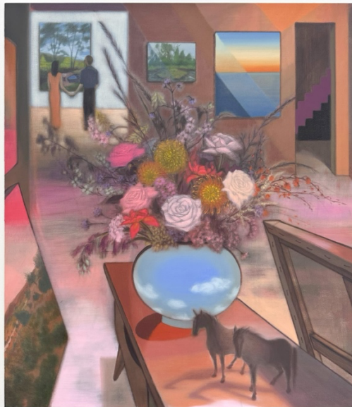
Guimi You, "Blessed Blossom" (2023), oil on linen, 48 x 41 3/4 inches