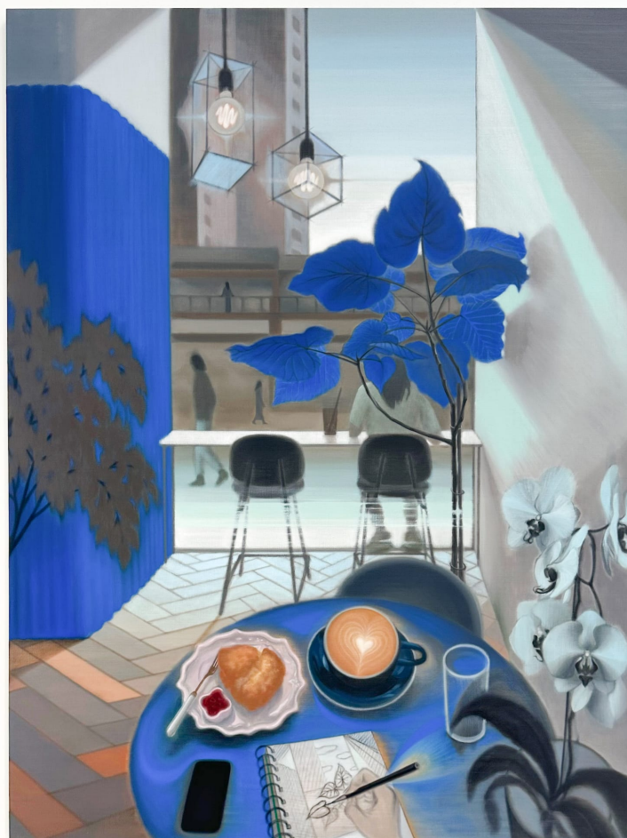
Guimi You, "Sketch in the Cafe" (2023), oil on linen, 76 x 57 1/8 inches

These carefully constructed works remind me of the magical realism found in children's book illustrations. They exude a sense of sweet, childlike wonder, where each moment is filled with possibility, and remind us that plenty of beauty and magic can be found in even the most mundane moments.