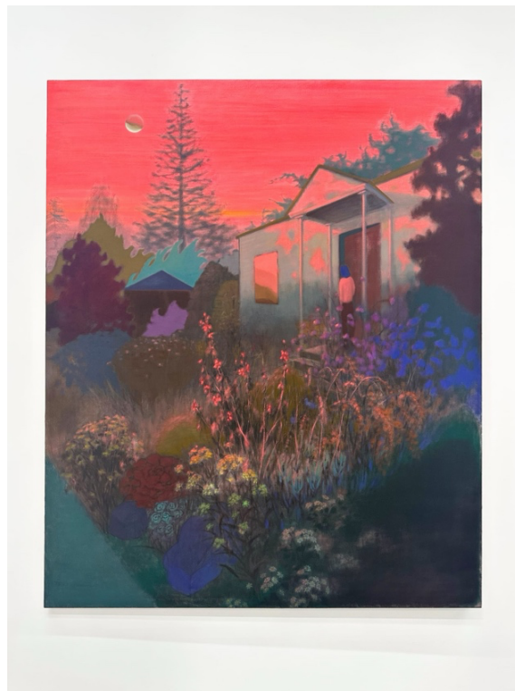
Guimi You, "Sunset in California" (2022), oil on linen, 80 x 66 inches

Guimi You: Winter Blossom continues at Make Room (6361 Waring Ave, Hollywood, Los Angeles) through December 2. The exhibition was organized by the gallery.