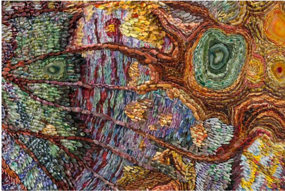
Detail of "Blue Admiral Wing" (2025)

For Manson, understanding that decay is inevitable doesn't diminish nature's beauty or intrigue. Instead, her sculptures invite us to get lost in the minute intricacies of each form, embracing the striking, rippling forms as they are in the moment.