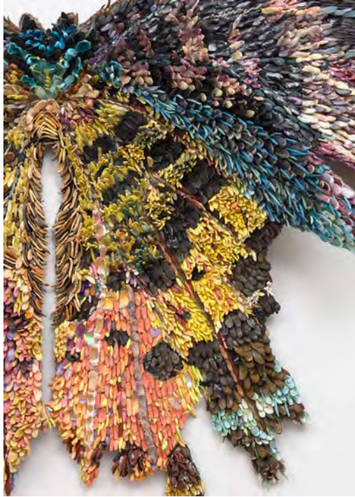
Detail of "Double Madagascar" (2025)