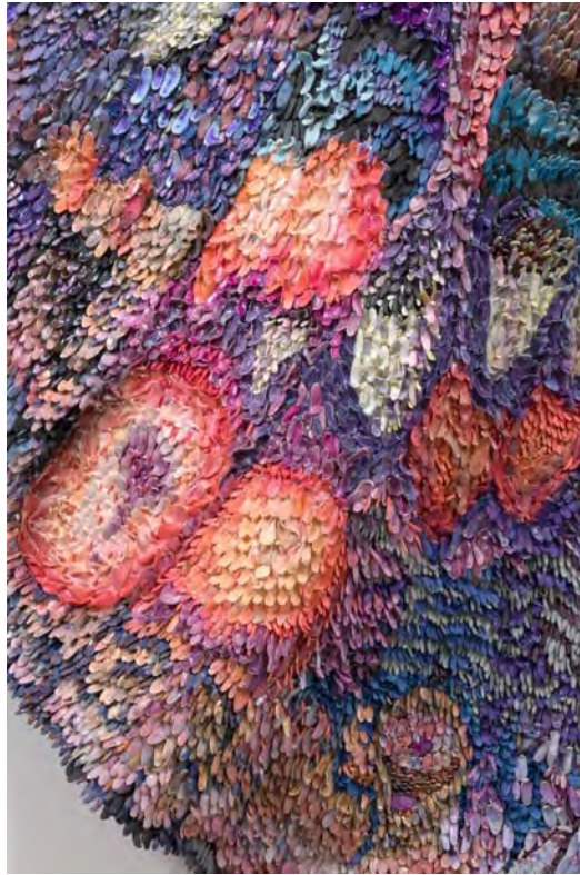
Detail of "Purple Aurora" (2025)