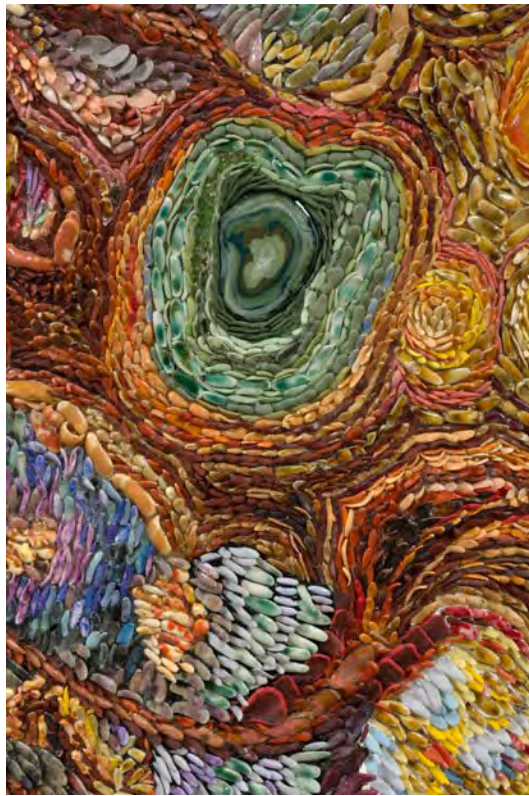
Detail of "Blue Admiral Wing" (2025)