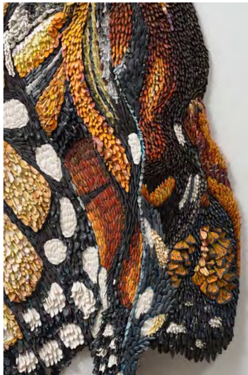
Detail of "Emerging Monarch" (2025)