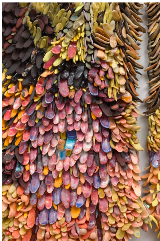
Detail of "Double Madagascar"