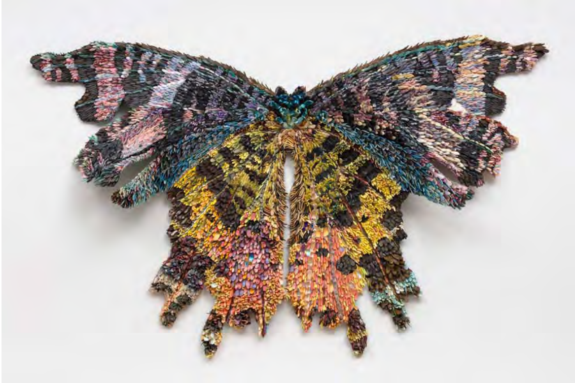
"Double Madagascar" (2025), porcelain, glaze, adhesives, canvas, hardware, dye, pigment, thread, 41 x 56 x 3 inches.

An unwavering desire to play with scale, permanence, and fragility recurs in Rebecca Manson's practice. The New York-based artist (previously) is known for magnifying the minuscule and preserving fleeting lifeforms in porcelain, a material regarded for both its resilience and delicacy. These dichotomies emerge through dynamic sculptures of butterflies and moths that drape down walls and across floors in dramatic displays.