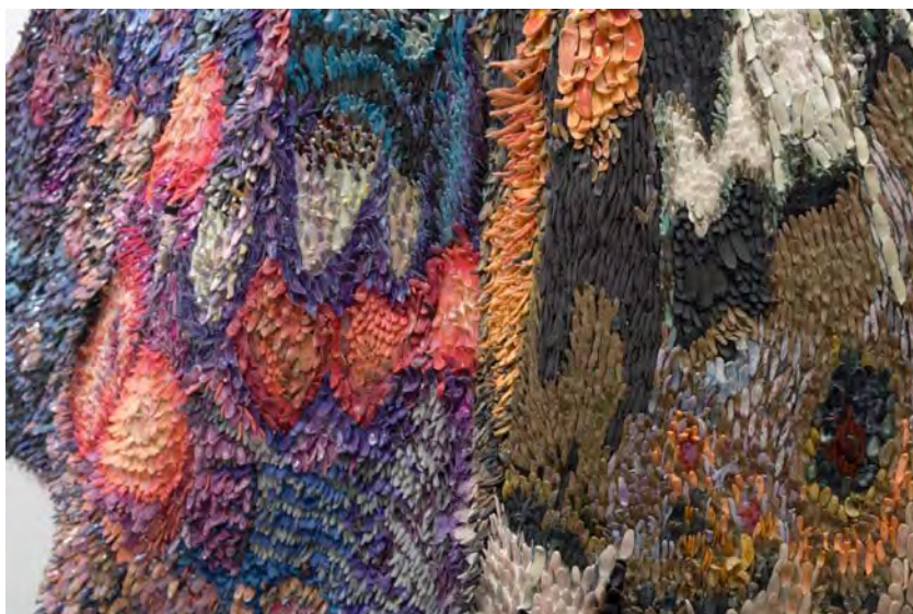
Detail of "Purple Aurora" (2025)