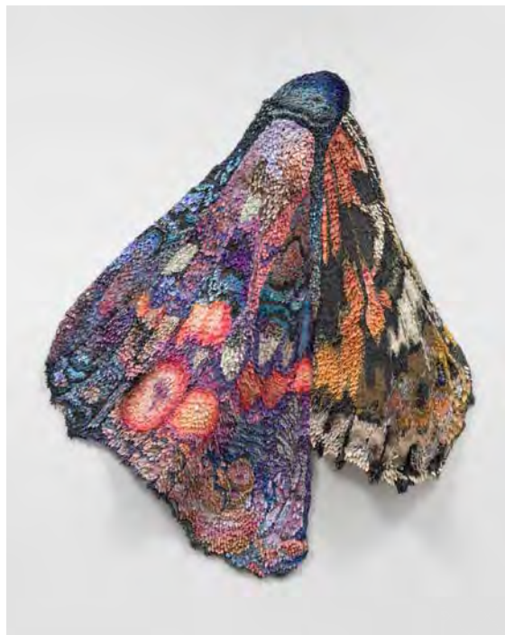
"Purple Aurora" (2025), porcelain, glaze, adhesives, canvas, pigment, and hardware, 70 x 64 x 5 inches

Time, You Must Be Laughing runs from January 8 to February 28 in San Francisco. Find more from Manson on Instagram.