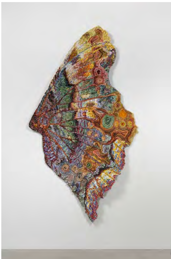
"Blue Admiral Wing" (2025), porcelain, glaze, adhesives, canvas, hardware, and glass, 97 x 56 x 2 inches