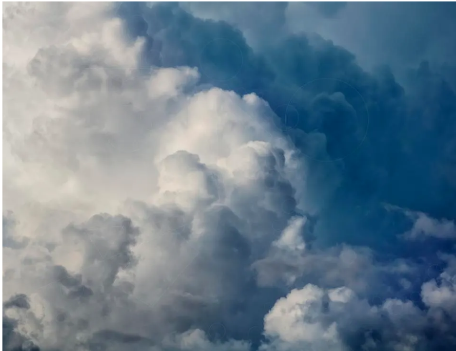
Trevor Paglen. CLOUD #902 Scale Invariant Feature Transform; Watershed , 2019. dye sublimation on wallpaper. Courtesy of the artist and Metro Pictures, New York, HPI.2020.16

Instructing a system trained on ImageNet to label people, and showing people what the system sees, is one example of Paglen's cyber-muckraking. Another case, more ambiguous on first viewing, involves image-processing of natural phenomena by computer vision algorithms. For instance, CLOUD #902 Scale Invariant Feature Transform; Watershed , shows a storm cloud overlaid with what appears to be a random assortment of geometric shapes. In fact the circles and lines are marks of the AI struggling to process atmospheric conditions using the training it received in an industrial setting.