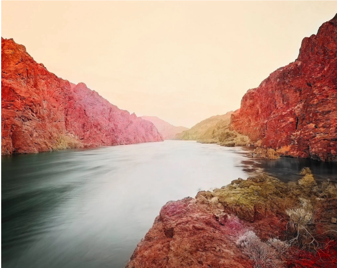
"The Black Canyon Deep Semantic Image Segments," 2020, dye sublimation print.

In "Opposing Geometries," though, Mr. Paglen — who has a Ph.D. in geography and an M.F.A. — is thinking about the history of images as well as the future. "If you look at these histories of technical image-making, they're always, if not part of a military project, adjacent to one and nurtured by it, so in some ways we have these very contiguous histories," he said.