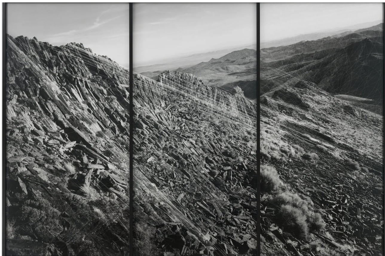
Karnak, Montezuma Range Haar; Hough Transform; Hough Circles; Watershed, 2018, a triptych of gelatin silver prints that are part of Mr. Paglen's ongoing exploration of the history of photography and the American West.

Some of Mr. Paglen's photographs do look uncannily like Carleton Watkins's early photographs of Yosemite, and were in fact created using a historical printing process called albumen. But he also ran the photographs through computer vision algorithms, which struggle to identify objects in their natural environment, generating instead lines and shapes on the images' surface. The resulting photos are once hyper-modern and antiquarian, tying the past and present through technology.