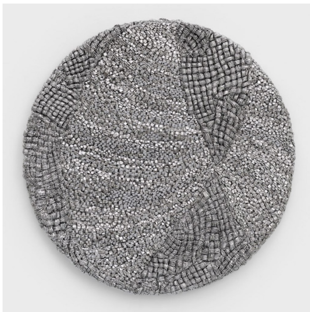
Pae White, ring of bright water (2024).