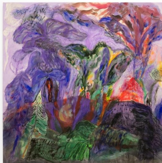
Left: Paul Wright. Vacation (2024). Oil on Canvas. 60 x 48 Inches.