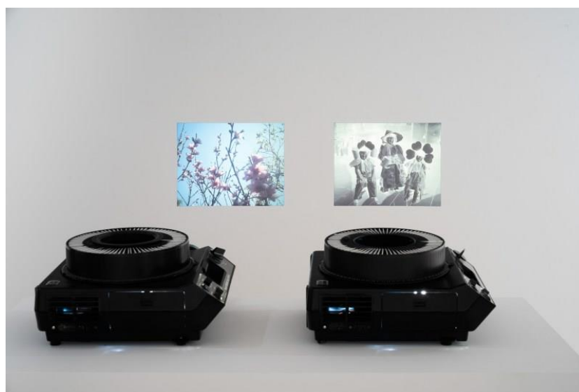
Dashiell Manley, Tule Lake (installation view) (2024). Digital file projected by two Kodak 5600 projectors, 6 minutes and 22 seconds. Jessica Silverman, San Francisco, 2024. Image courtesy of the artist and Jessica Silverman, San Francisco. Photo: Phillip Maisel.