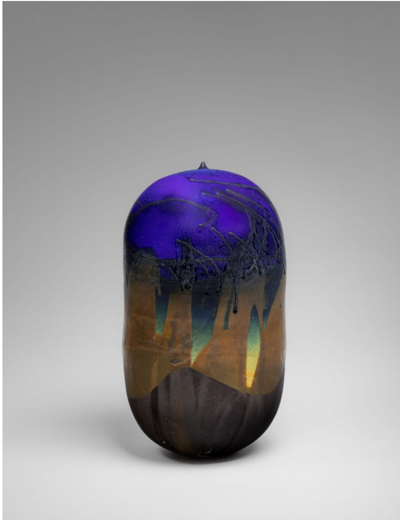
Toshiko Takaezu, "Closed Form" (2004), porcelain, 19 1/2 x 11 inches.

(© Family of Toshiko Takaezu; photo by Nicholas Knight, courtesy the Isamu Noguchi Foundation and Garden Museum)