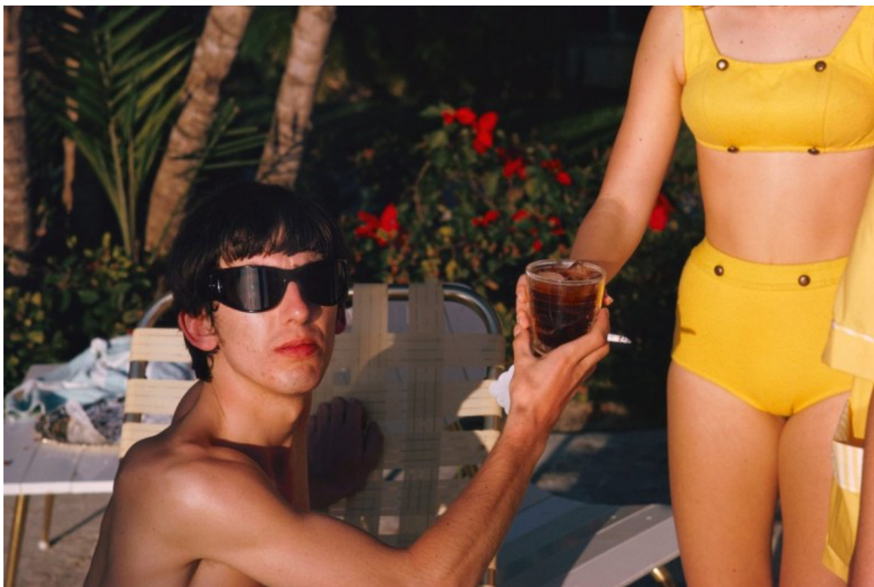
Paul McCartney, "George Harrison. Miami Beach, February 1964" (1964), chromogenic print