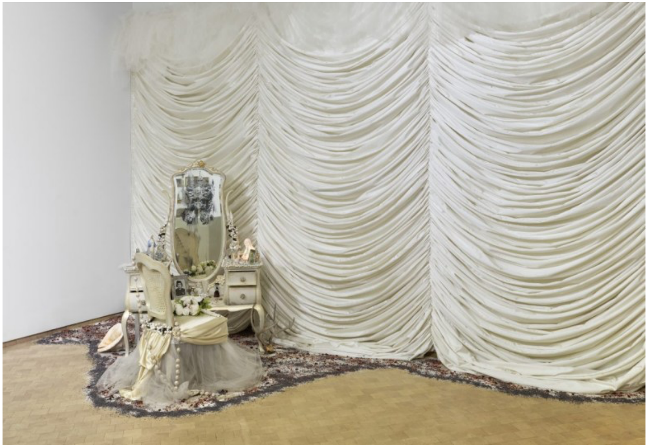
Installation view of Amalia Mesa-Bains, "Venus Envy Chapter I: First Holy Communion, Moments Before the End" (1993/2022)