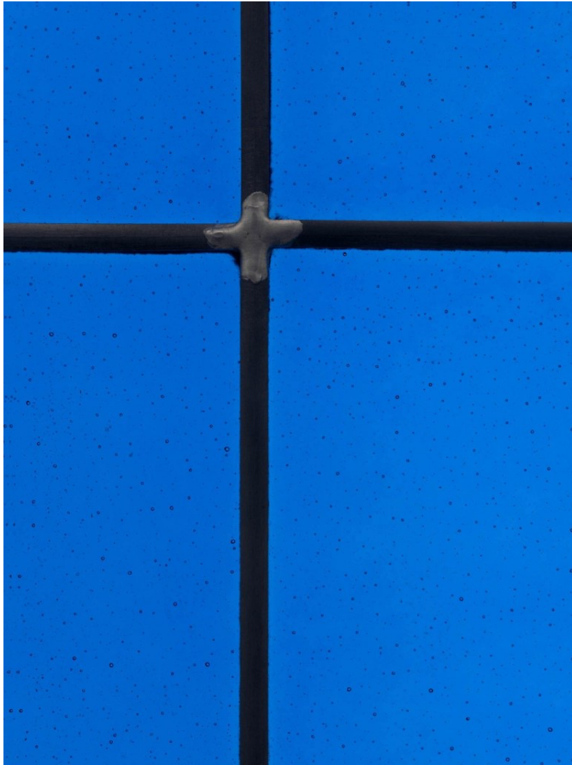
Detail of Diamond Stingily, "Window 1" (2024) (© Diamond Stingily; courtesy the artist and 52 Walker)