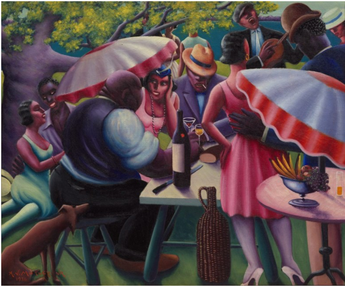
Archibald J. Motley, Jr., "The Picnic" (1936), oil on canvas, 30 x 36 inches

© Estate of Archibald John Motley Jr. All reserved rights 2023 / Bridgeman Images; image © The Metropolitan Museum of Art; photo by Juan Trujillo, courtesy the Metropolitan Museum of Art)