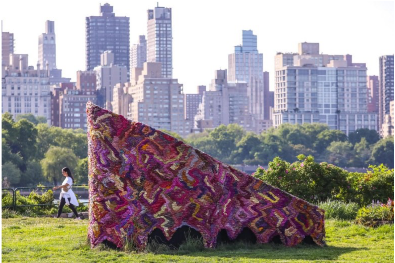
Suchitra Mattai, "becoming" (2024)