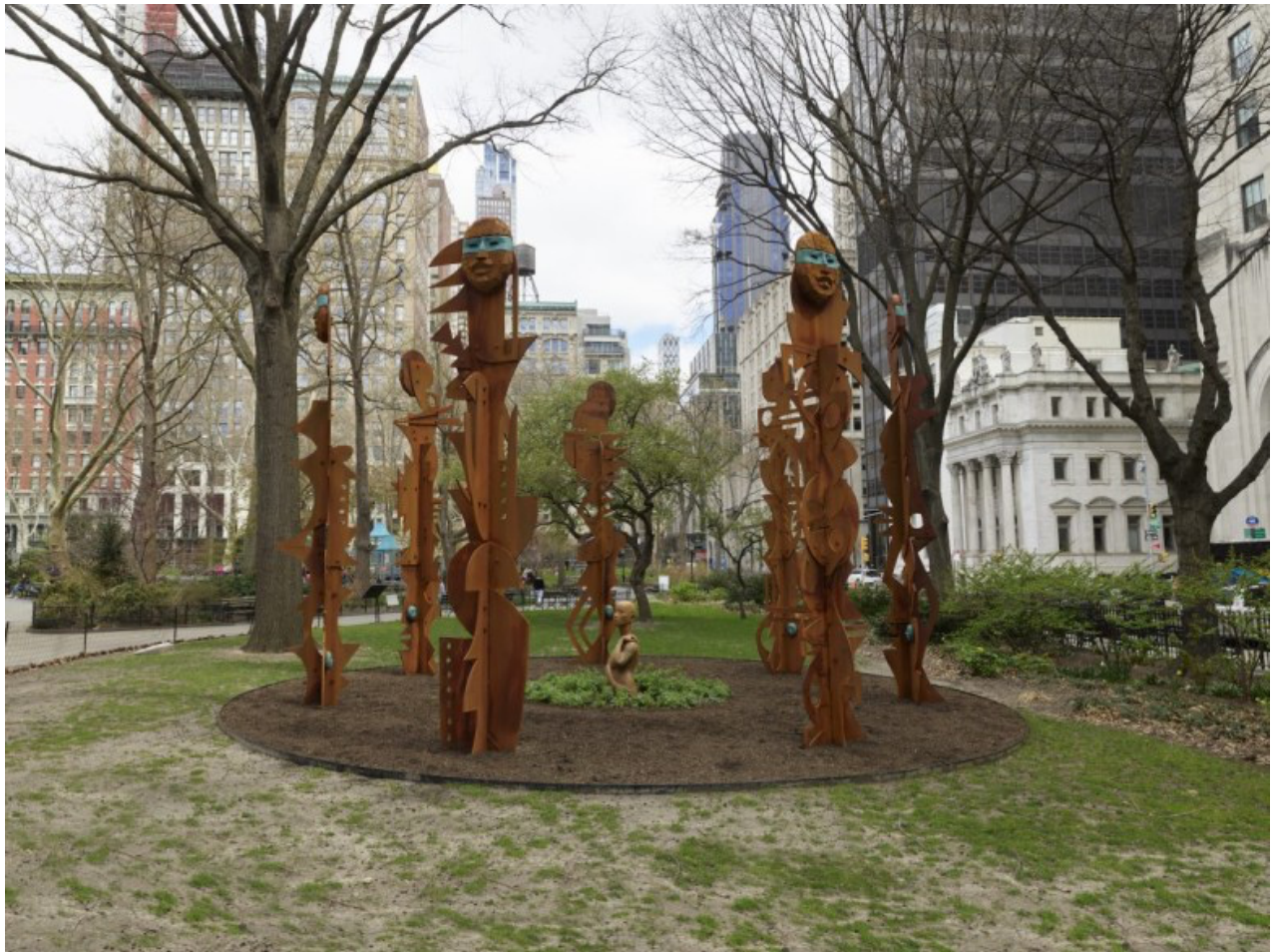
Installation view of Rose B. Simpson, "Seed" (2024)