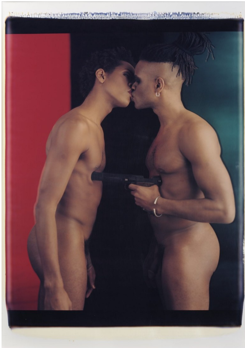
Lyle Ashton Harris, "Brotherhood, Crossroads and Etcetera #2 [in collaboration with Thomas Allen Harris]" (1994), polaroid 25 x 20 inches