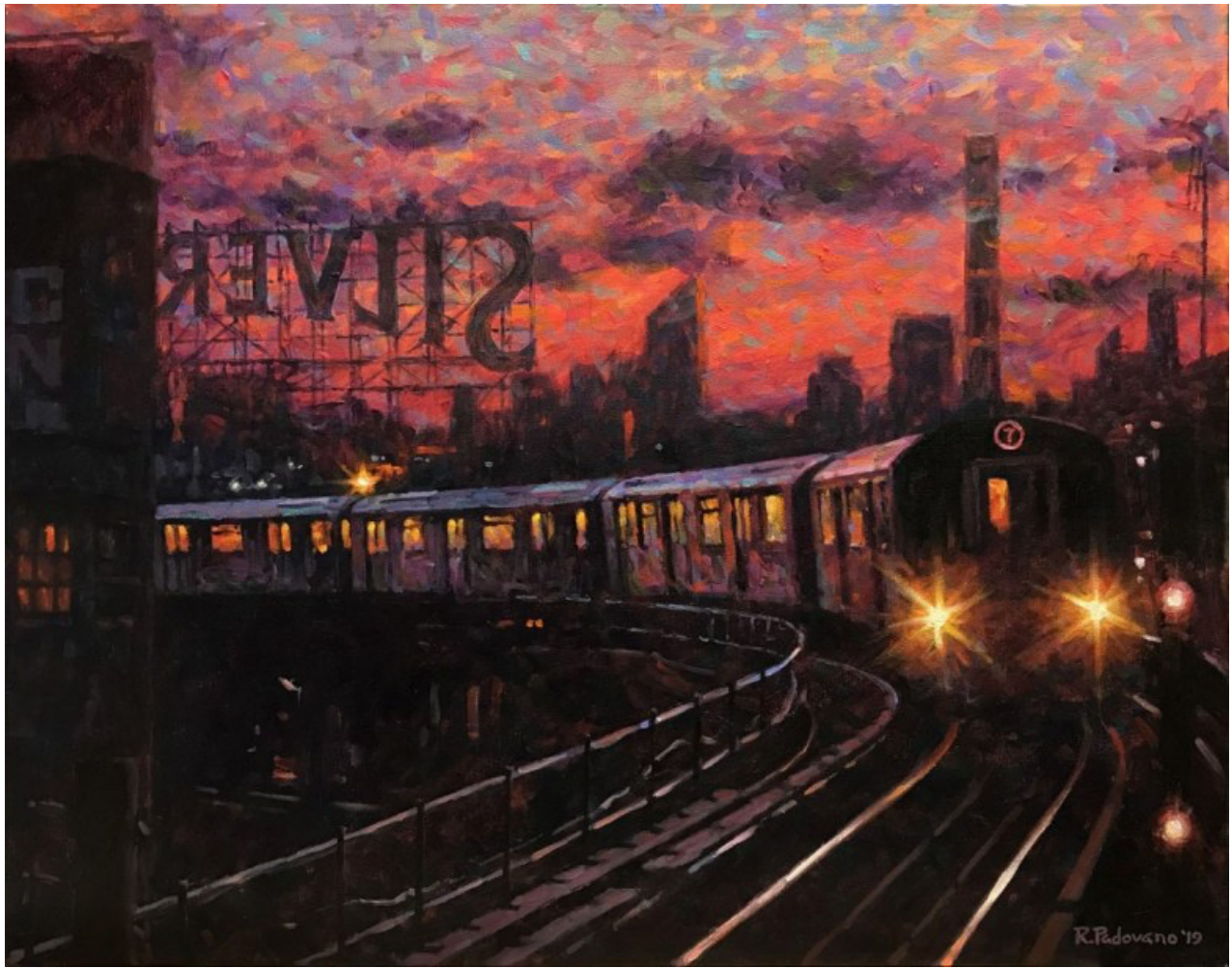
Robert Padovano, "Silvercup Sunset II" (2019), acrylic on canvas, 22 x 28 inches (courtesy the artist)