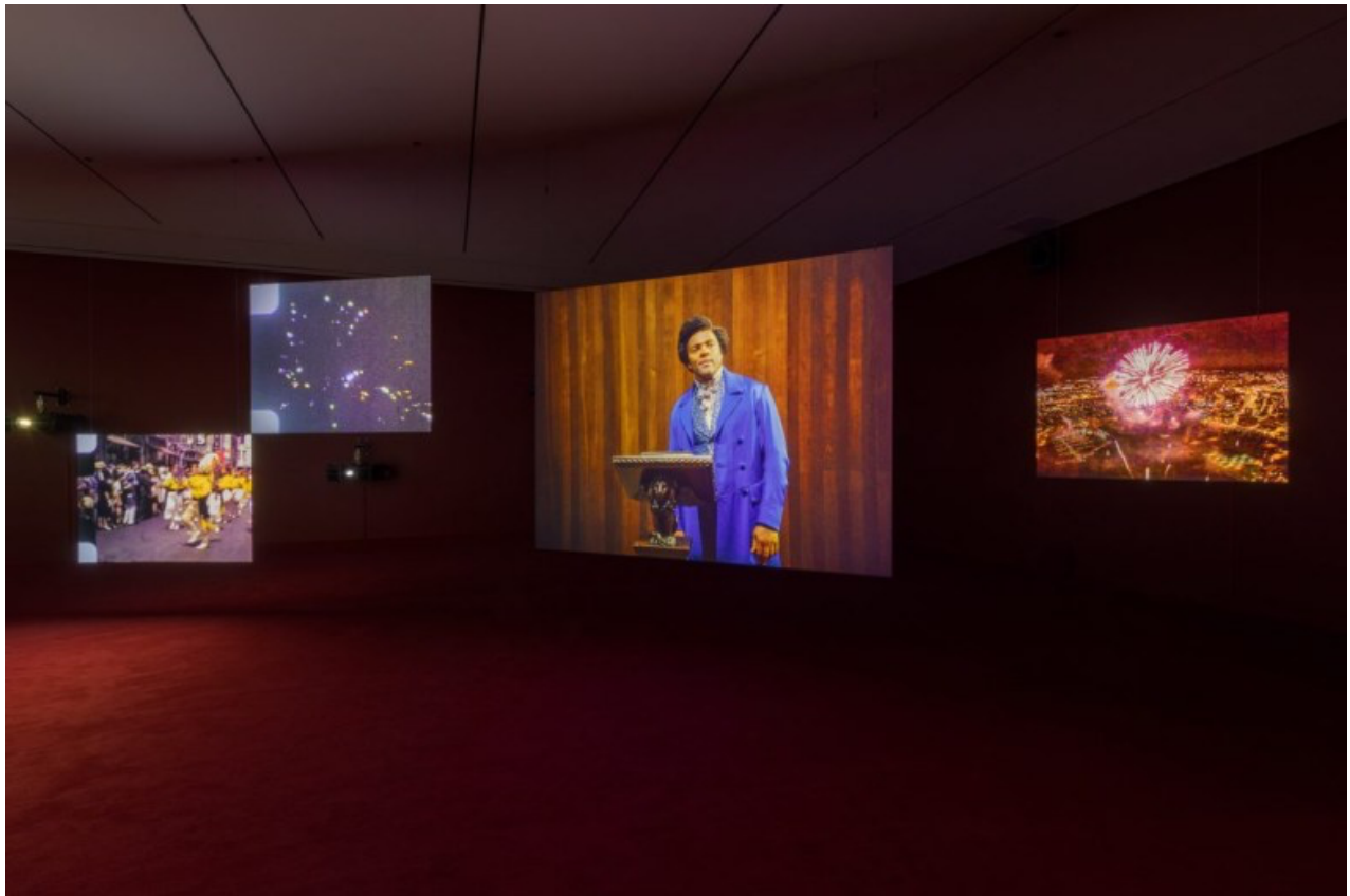
Installation view of Isaac Julien, "Lessons of the Hour"