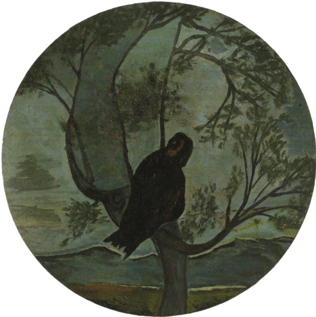
Frank Walter, "Untitled (Black bird in tree)" (undated), oil on biocomposite material, 7 5/8 inches in diameter