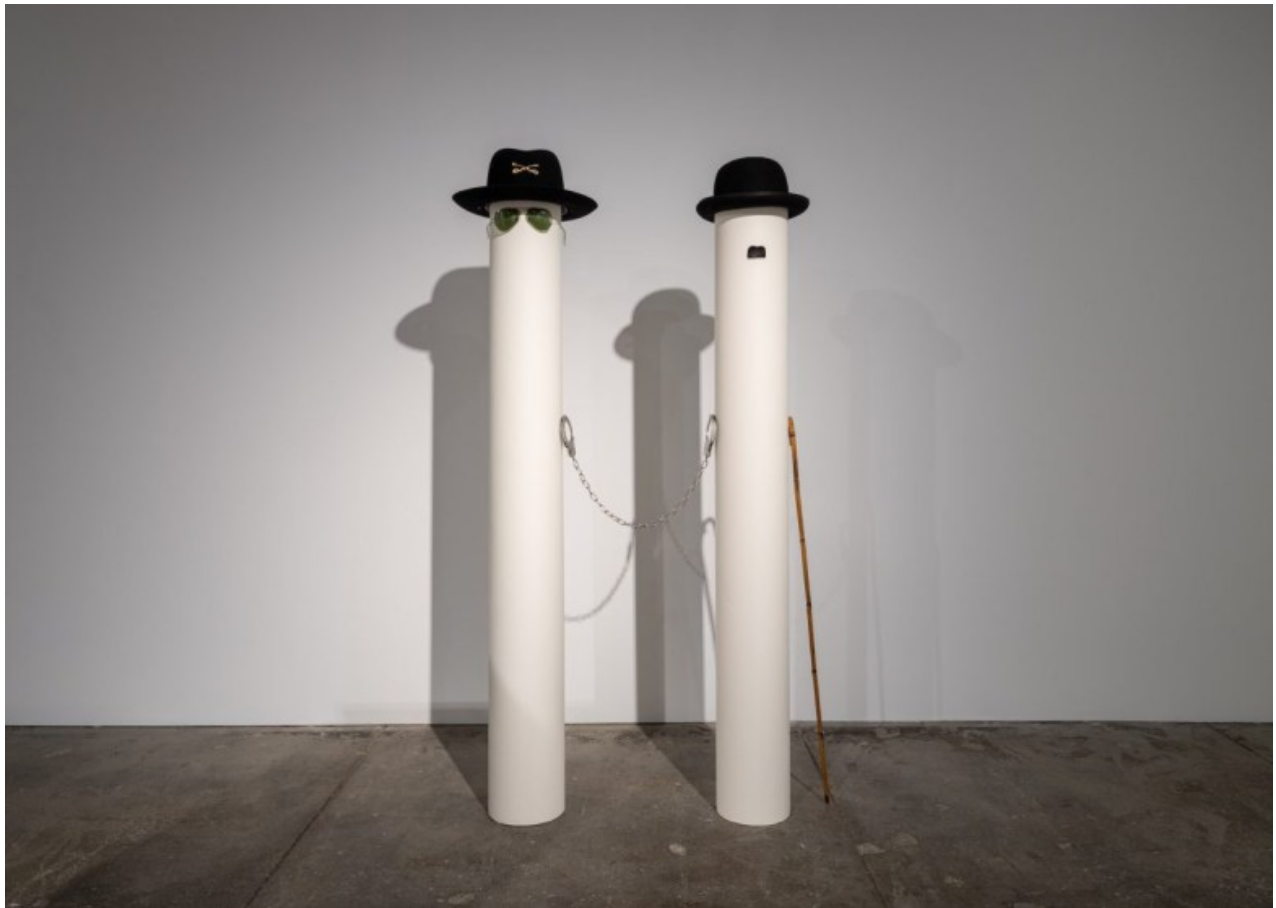
Installation view of Javier Téllez, "Charlie don't surf" (2024), derby bowler hat, Cavalry hat, sunglasses, metal handcuff, bamboo cane, artificial hair, Fabriano paper, cardboard, 57 x 50 x 50 inches