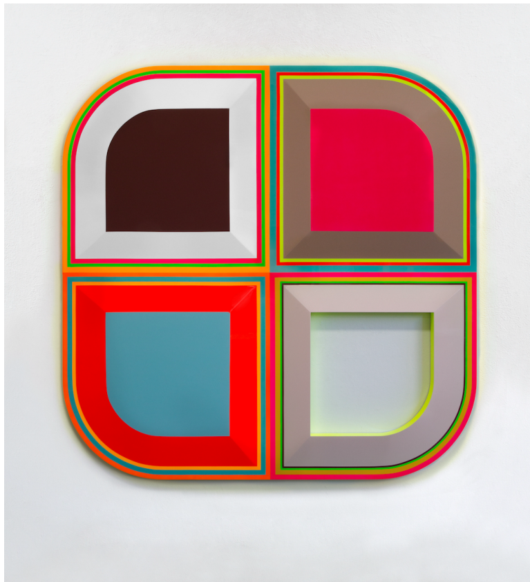
Beverly Fishman. Untitled (Opioid Addiction) , 2016. Urethane paint on wood; 62 x 62 x 2 inches.

From the pillbox, Beverly Fishman chooses colors with a calculating eye. A master colorist, Fishman explores the allure of intoxication: the fluorescent highs of addiction and sickly tones of withdrawal. With her vivid and enticingly colored pill-like works, Fishman formulates a response to the role of aesthetics within the pharmaceutical industry. She appropriates the visual vocabulary of postindustrial minimalism to delve into the psychology of addiction. For an addict, the subtle yet familiar color, shape, and packaging of pills can trigger a biological response, a craving for the next fix that soon morphs into a twisted brand loyalty. As a result, prescription drugs like Oxycodone, Demerol, and Vicodin maintain a cult following, which leads us to an essential question raised by Fishman's work: what turns the consumer into the consumed?