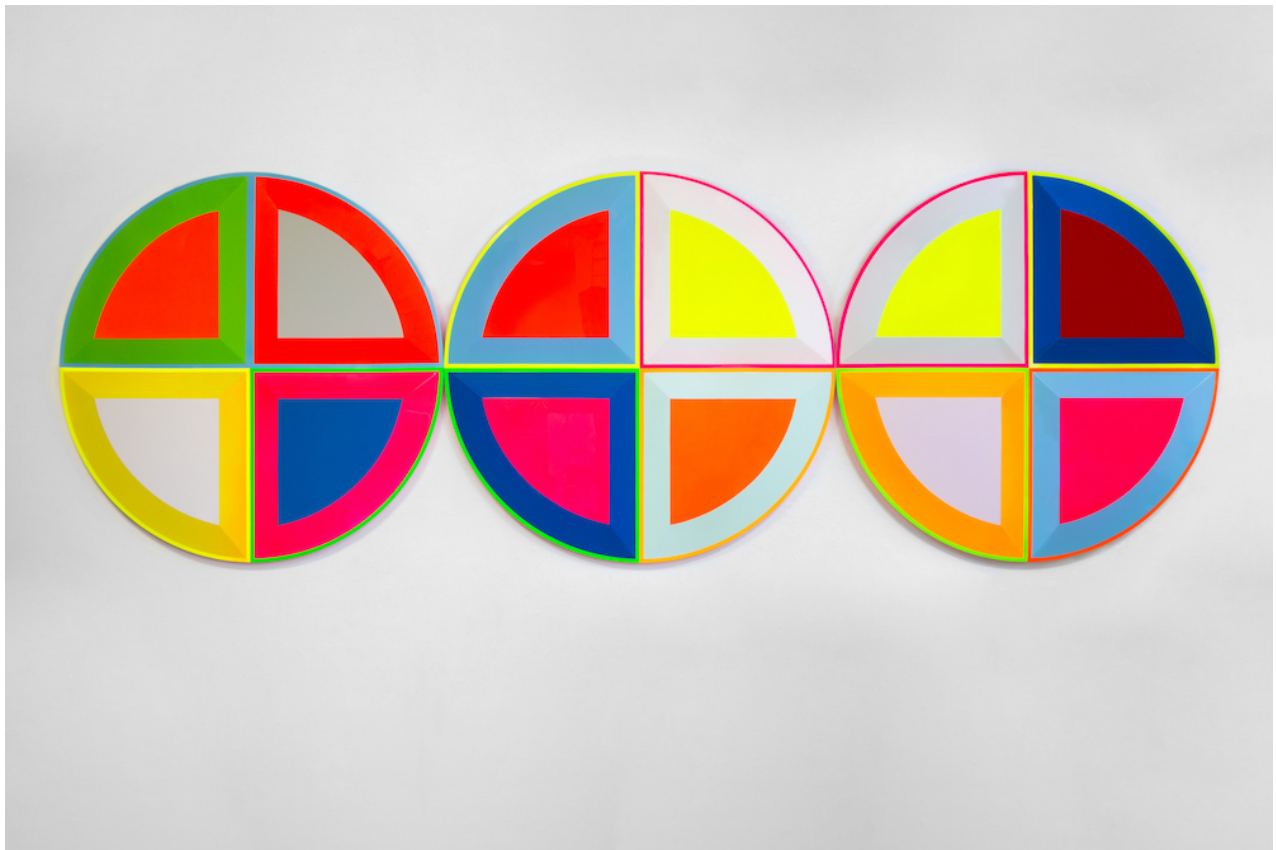
Beverly Fishman. Untitled (ADHD) , 2016. Urethane paint on wood; 60 x 180 x 2.25 inches.

Fishman draws attention to one of this country's most insidious epidemics, prescription-drug addiction, approaching it in a non-histrionic way from the perspective of an artist and art historian. She explores the significance of color in medicine and delivers a visual code for addiction through the language of modernism, offering her viewers an access point into the psychology of addicts and the pharmaceutical companies that make them.