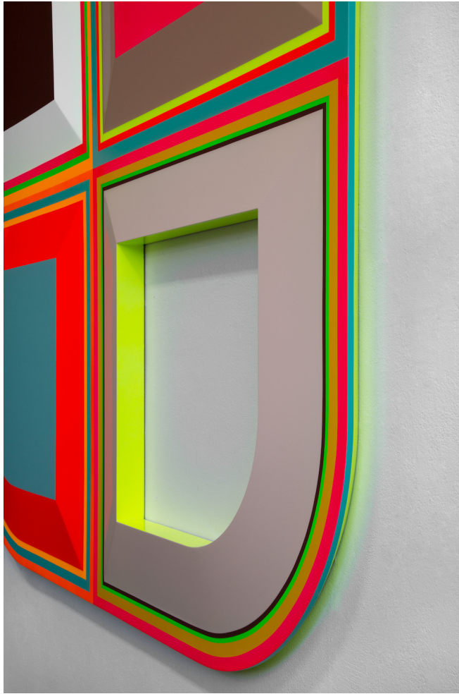
Beverly Fishman. Untitled (Opioid Addiction) , detail, 2016. Urethane paint on wood; 62 x 62 x 2 inches.

With the right concoctions, Fishman imbues her work with such vibrancy that her pills envelop viewers in her aesthetic world. The luminescent effects she creates echo her longstanding interest in glow paint, as in her earlier glow-in-the-dark ecstasy pills. Fishman allows her sculptures to glow—on the edges, as in Untitled (Anxiety) , and in the empty spaces of pills like Untitled (Opioid Addiction) —throwing a wash of color onto the gallery’s white walls. In works like the latter, the artist fills a void with nothing but the slightest suggestion of color—photons invisibly bouncing off a hard surface. Formally, Fishman recalls Mark Rothko’s investigation of color’s ambiguous relationship with space. In a Rothko painting, colors are repeatedly unseated in the picture plane, shifting between foreground, background, and middle ground. Adapting this idea to wall sculpture, Fishman’s atmospheric pigments test depth in a three-dimensional space, deconstructing through optical illusions our belief that color is a flat phenomenon.