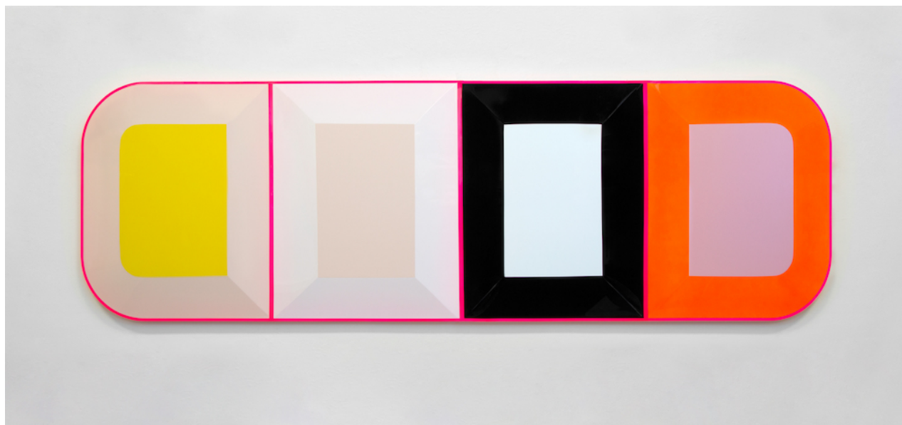
Beverly Fishman. Untitled (Anxiety) , 2016. Urethane paint on wood; 39 x 126 x 2 inches. Private collection.

Fishman leads viewers on an exploration of the nexus between medical and visual conditioning. What are the sensory responses leading to addiction, and how are they hardwired in the human brain? Works such as Untitled (Symptoms Associated with Taking Opiates) exemplify the artist's vibrant color palette: bright, ecstatic, neon. Fishman replicates colors used in advertisements to catch the viewer's eye. Initial responses to these colors bring familiar associations: neon yellows and hot pinks are filled with electricity, a symbolic nod to the highest highs of stimulants; electric blues and bright greens have a calming effect that visually mimics that of anti-anxiety drugs. Where Fishman excels is in restraint, for the brighter colors are often relegated to the outlines of her pill sculptures. As a practitioner of color theory, she recalls some lessons of modernism and minimalism, exercising restraint for maximum effect. Her neon colors are like candy coatings on her pills, hiding darker cores that represent the sinister side of addiction and withdrawal.