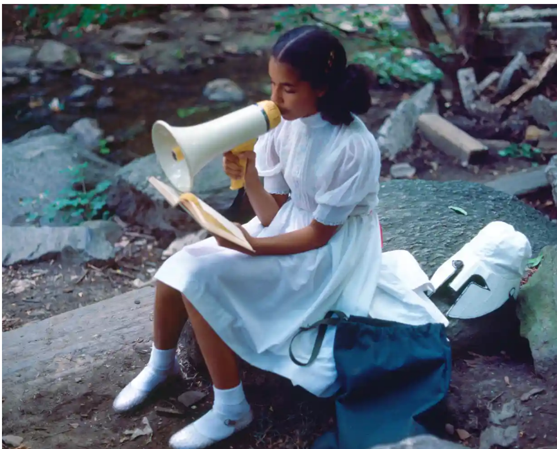
Lorraine O'Grady - Rivers, First Draft: A Little Girl with Pink Sash memorizes her Latin lesson, 1982, printed 2015.