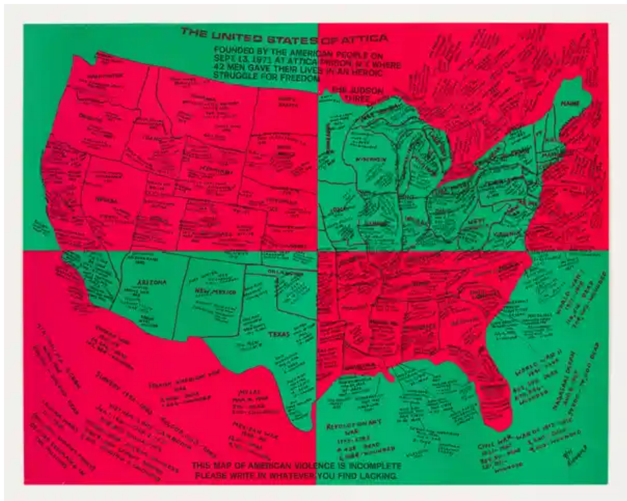
Faith Ringgold - United States of Attica, 1971.