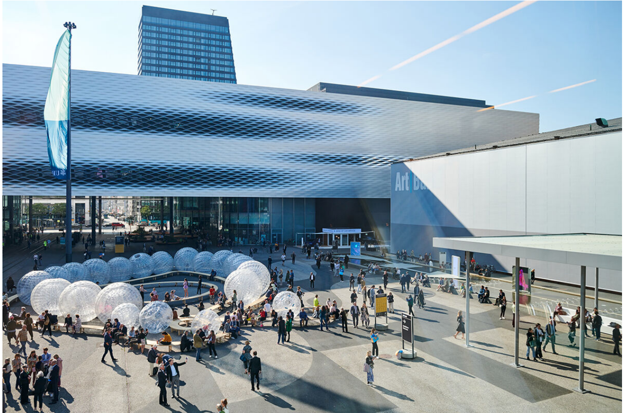
Exterior view of Art Basel, Basel, 2021.

With its 2020 edition held only online, and its 2021 edition delayed until September to allow the global vaccination program to take effect (at least in some countries) and global travel restrictions to be loosened, the 51st iteration of Art Basel in Basel has already overcome challenges. The second of Art Basel's fairs to happen in person since the pandemic hit (the first was Art Basel in Hong Kong in May 2021), the event opened amid questions: Would dealers be able to make it? Would collectors be deterred by the challenges of travel and complex safety measures? Masks are required for all visitors, in addition to a negative test result or vaccine proof, which, due to the shift in Switzerland's travel protocols, those who received the Astra-Zeneca vaccine outside the European Union were only able to obtain at the eleventh hour.