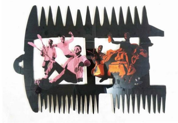
A sculpture series by Conrad Egyir features a comb theme.

His work also has been displayed in galleries in San Francisco, New York, and Miami, and now in the collections of Cranbrook Art Museum, Perez Art Museum, and the JPMorgan Chase Art Collection. It also was featured in Beyoncé’s 2020 album “Black Is King.”