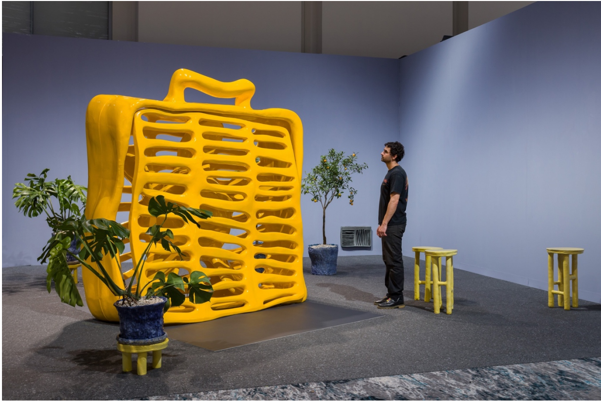
Cool Composition by Woody De Othello at Art Basel in Miami Beach.