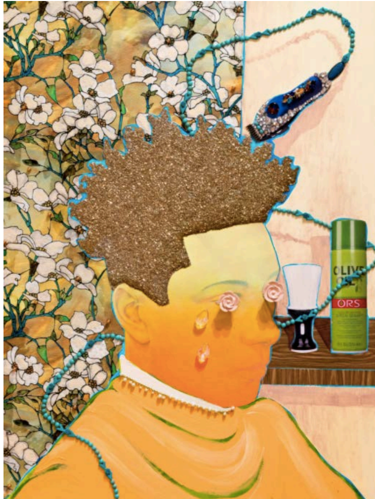
Devan Shimoyama's painting "Shape Up and a Trim" (2017) is on view at the Studio Museum in Harlem's survey of work by emerging artists.

In its 2001 exhibition "Freestyle," the Studio Museum in Harlem ushered a brilliant batch of emerging artists of African and Latino descent onto the art world's main stage. To our immense benefit, several more such group introductions have followed, "Fictions" being the latest.