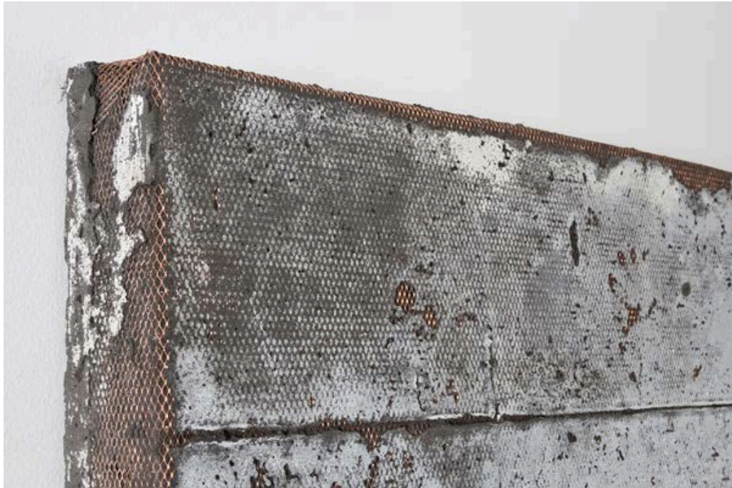
Detail of Davina Semo, "SHE LIKED TO KEEP HERSELF TO HERSELF," 2015. Acrylic spray paint transfer on pigmented reinforced concrete, copper mesh, candle wicks, 27 1/4 × 84 × 15/8". Courtesy U.S. Blues, New York, and Marlborough Chelsea, New York. Photo: Jon De Cola.

Her titles are often altered appropriations from other texts, always written in all caps. That tactic is now often taken as the equivalent of shouting; it's the only emphasis most digital text will allow for. But in the context of industrial materials, Semo's titles are absolute, authoritative—even when the utterance speaks uncertainty. Much of it describes people, often with third-person feminine pronouns. A stainless steel cast of a jailhouse shiv at Rawson is called "SHE DRANK THE COFFEE AND SLID HER CUP FORWARD FOR MORE" (2015). Someone's conversation is terminated by a concrete slab, titled "I HEAR YOU SAYING THIS VERY HARD BUT YOU'VE DECIDED WHAT YOU NEED TO DO" (2015). The words are cutting.