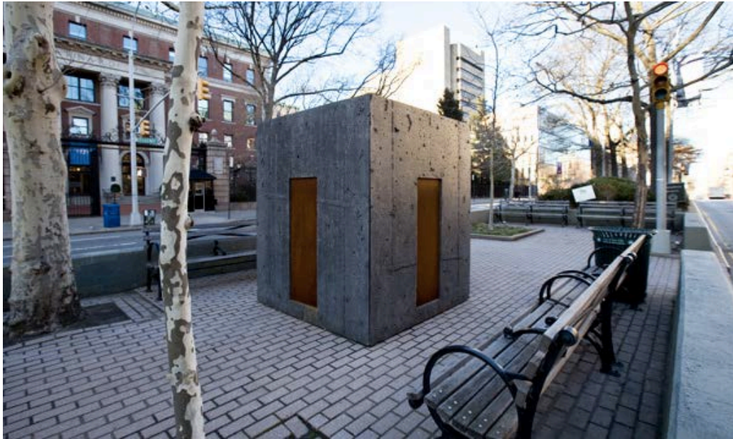
Davina Semo, "EVERYTHING IS PERMITTED," 2014. Pigmented reinforced concrete, Cor-ten steel, 6 × 6 × 7'. Broadway Morey Boogie, 117th Street & Broadway, New York.

The rust-streaked and pockmarked exterior of "EVERYTHING IS PERMITTED" exudes authority. It resembles a citadel or sepulcher with no entrance, all enclosure, mimicking sites where behavior is strictly delimited and controlled. While its title goads debauchery, and can be taken as an invitation to vandalism, the sculpture remains unviolated. Its perverse call for annihilation has been submitted to the higher cultural demand that art be preserved, and anyway, where's the rebellion in harming something that solicits abuse? 1