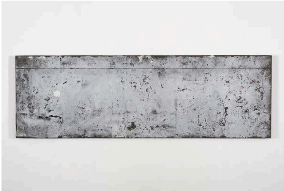
Davina Semo, "SHE LIKED TO KEEP HERSELF TO HERSELF," 2015. Acrylic spray paint transfer on pigmented, reinforced concrete, copper mesh, candle wicks, 27 1/4 × 84 × 1 5/8".

The titles for these artworks sound both like personal meditations and snippets of narrative. The block-and-leg-shackle sculpture is called "SHE OPENS HER EYES WIDE TO CLEAR HER HEAD" (2015). There's nacreous discoloration where the restraint attaches to its inset stainless steel base. The concrete's satiny beige-pink enamel plays against the green of a painted box and tender jade plants, sculptures titled "SHE HELD A HAND UP TO SIGNAL ME TO PLEASE STOP TALKING" and "INVOLVED IN THE DREAM SOMEHOW IS A DOG STANDING RIGIDLY IN THE DISTANCE" (both 2015), respectively. The relationship of the characters to themselves is uncertain, anxious, counter to the surety of the works themselves. As Semo describes the detainment facility in the catalogue, "The message of the room is clear in its simplicity: you are with us now." It's unclear if characters are persistent across several artworks, and that correlation is complicated by the delicate tenderness visible in some of the sculptures. The jade plants and a geode inlaid in one wall are tokens of stress reduction akin to the fetid Laz-E-Boy and Oriental-style carpet seen in some of the Guantánamo photos: they are comforting, but the situation's vivid and corporal torque is underscored by their presence.