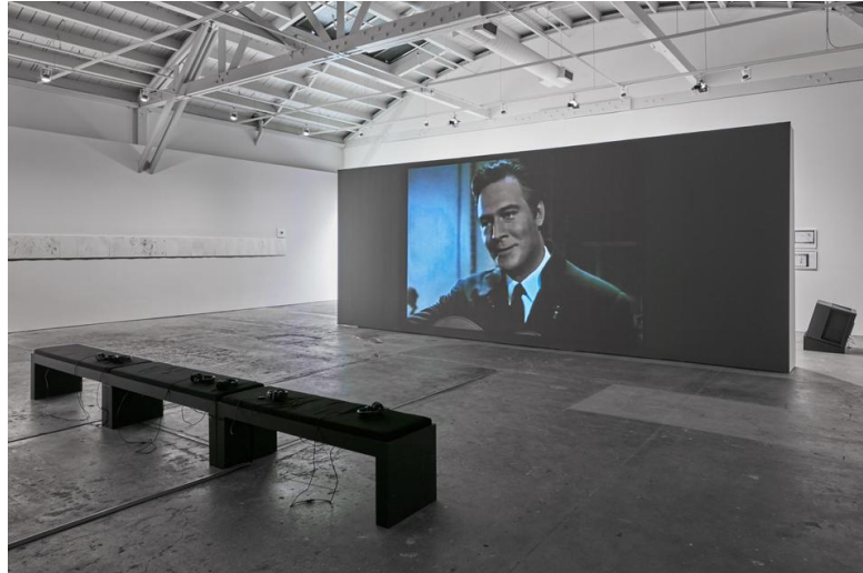
The Wattis Institute