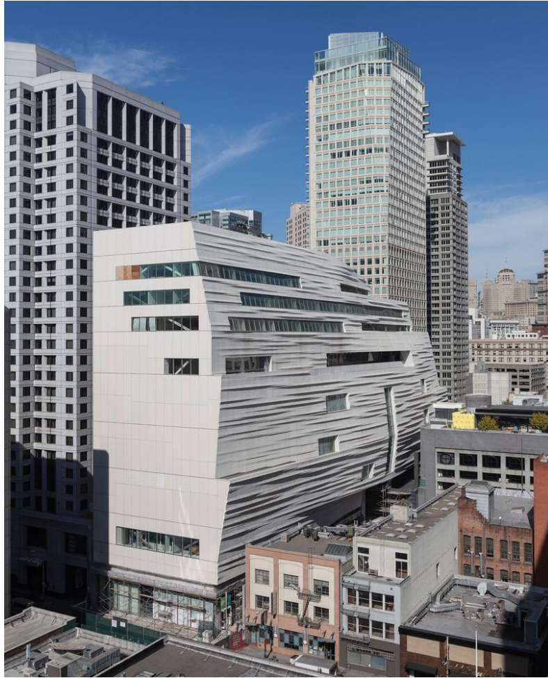
SFMOMA PHOTO: PHOTO © HENRIK KAM, COURTESY OF SFMOMA